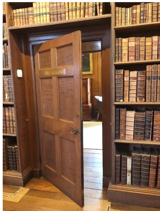
Christ Church Library, University of Oxford