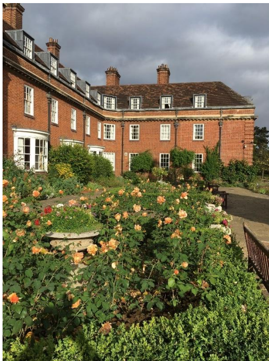
St Hugh's College, University of Oxford