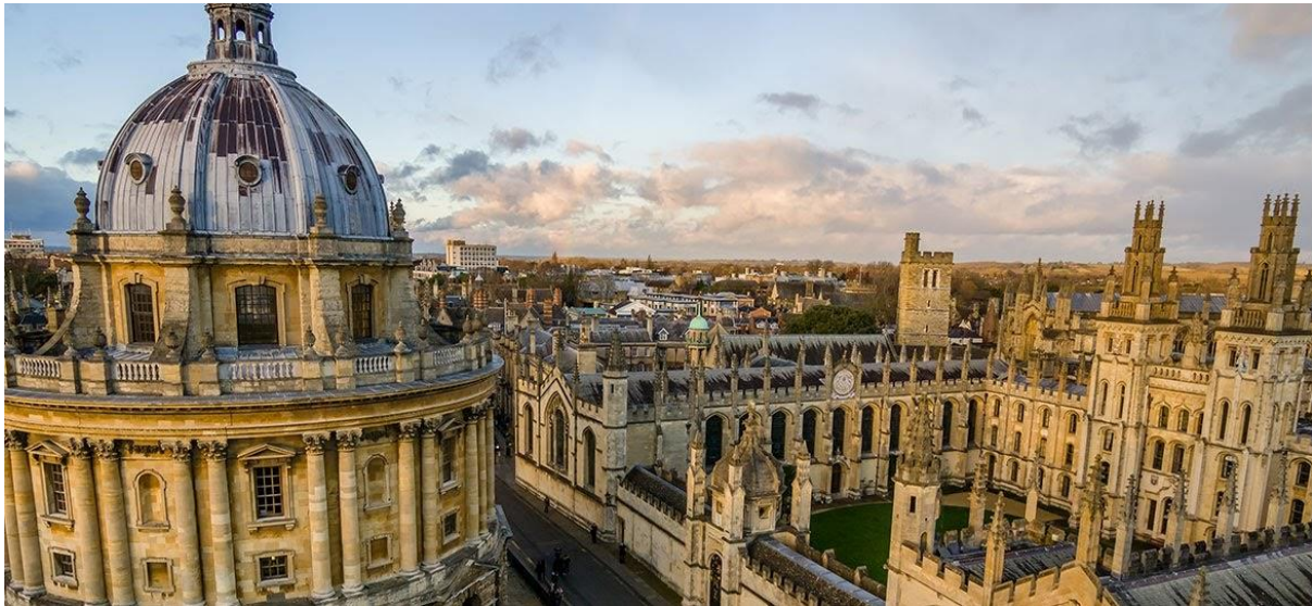
Oxford, Radcliffe Camera and All Soul's College.